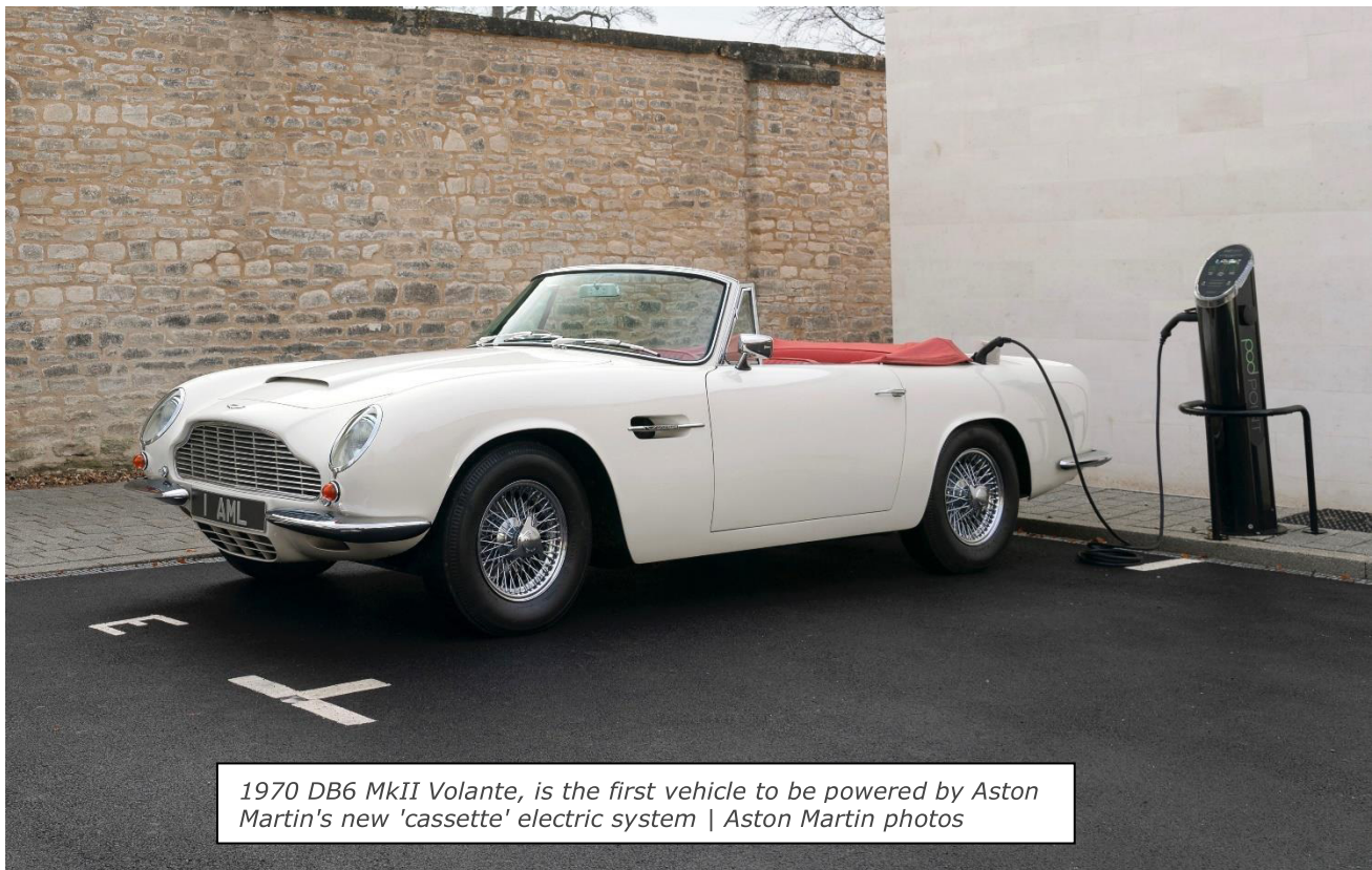
1970 DB6 MkII Volante, is the first vehicle to be powered by Aston Martin's new 'cassette' electric system

The what? The "electra-mod," a process by which classic cars get electric power, and it's a process that some automakers call future proofing.